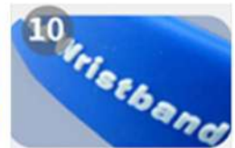
Embossed with color