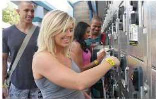
Gyms & Spas

The data on the wristband is accessed by RFID systems such as RFID Smart Readers and can enhance your bottom line and provide unmatched safety, security, and convenience to your guests for: