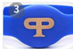
Laser with color