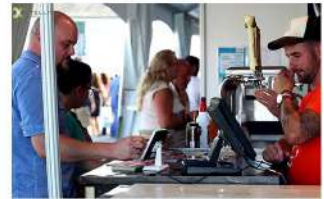
Clubs & Resorts