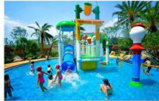
Water parks & pools