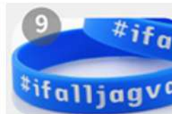
Debossed with color