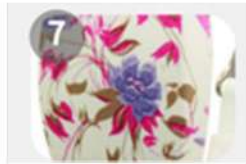
Heat transfer printing