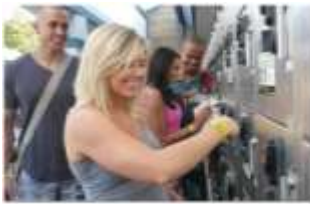
Gyms & Spas

The data on the wristband is accessed by RFID systems such as RFID Smart Readers and can enhance your bottom line and provide unmatched safety, security, and convenience to your guests for: