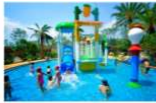
Water parks & pools