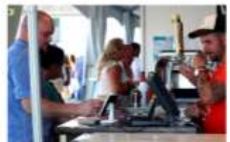
Clubs & Resorts