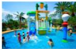
Water parks & pools