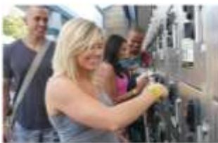
Gyms & Spas

The data on the wristband is accessed by RFID systems such as RFID Smart Readers and can enhance your bottom line and provide unmatched safety, security, and convenience to your guests for: