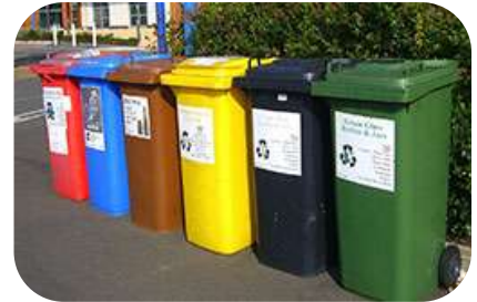
Waste Bin Management