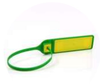
RFID PP tie tag