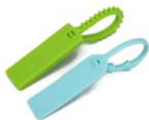
RFID silicone tie tags

Custom RFID cable tie tags made of different material, could offer more choice suitable for your project, such as silicone cable tie tags, ABS cable tie tags, PP cable tie tags, etc.