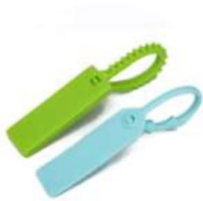
RFID silicone tie tags

Custom RFID cable tie tags made of different material, could offer more choice suitable for your project, such as silicone cable tie tags, ABS cable tie tags, PP cable tie tags, etc.