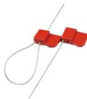
RFID ABS steel tag