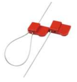
RFID ABS steel tag