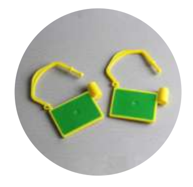
RFID PP tie tag