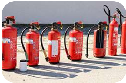
Gas Cylinder Tracking