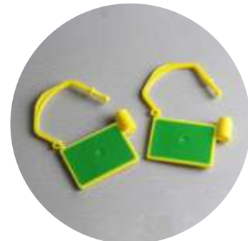
RFID PP tie tag