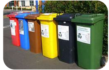
Waste Bin Management