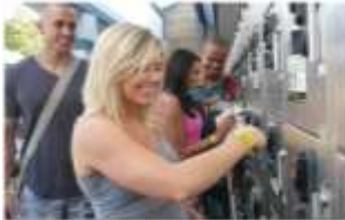
Gyms & Spas

The data on the wristband is accessed by RFID systems such as RFID Smart Readers and can enhance your bottom line and provide unmatched safety, security, and convenience to your guests for: