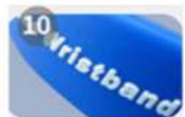
Embossed with color