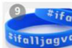
Debossed with color