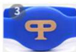
Laser with color