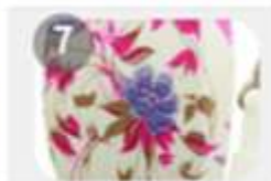
Heat transfer printing