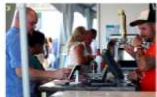
Clubs & Resorts