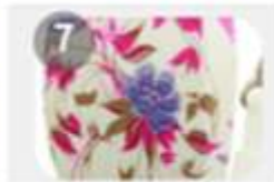
Heat transfer printing