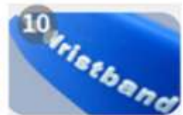
Embossed with color